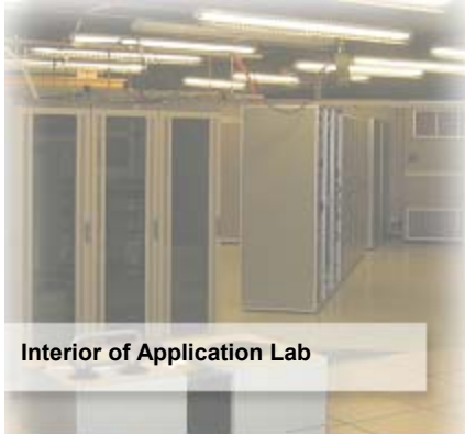
Interior of Application Lab